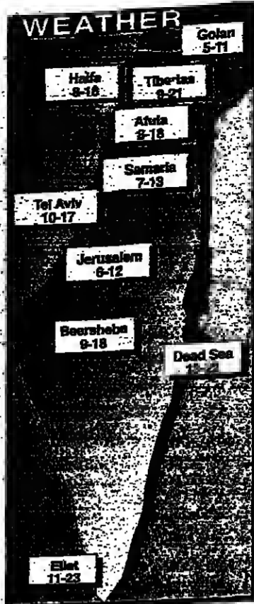
Forecast: Partly cloudy, additional drop in temperatures.